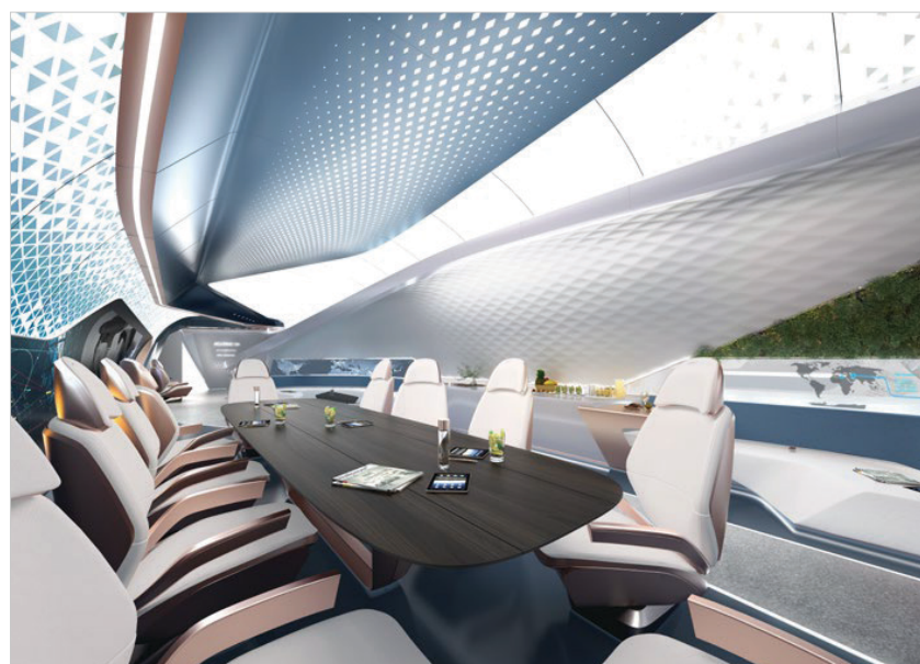
Looking into the forest during a board meeting break