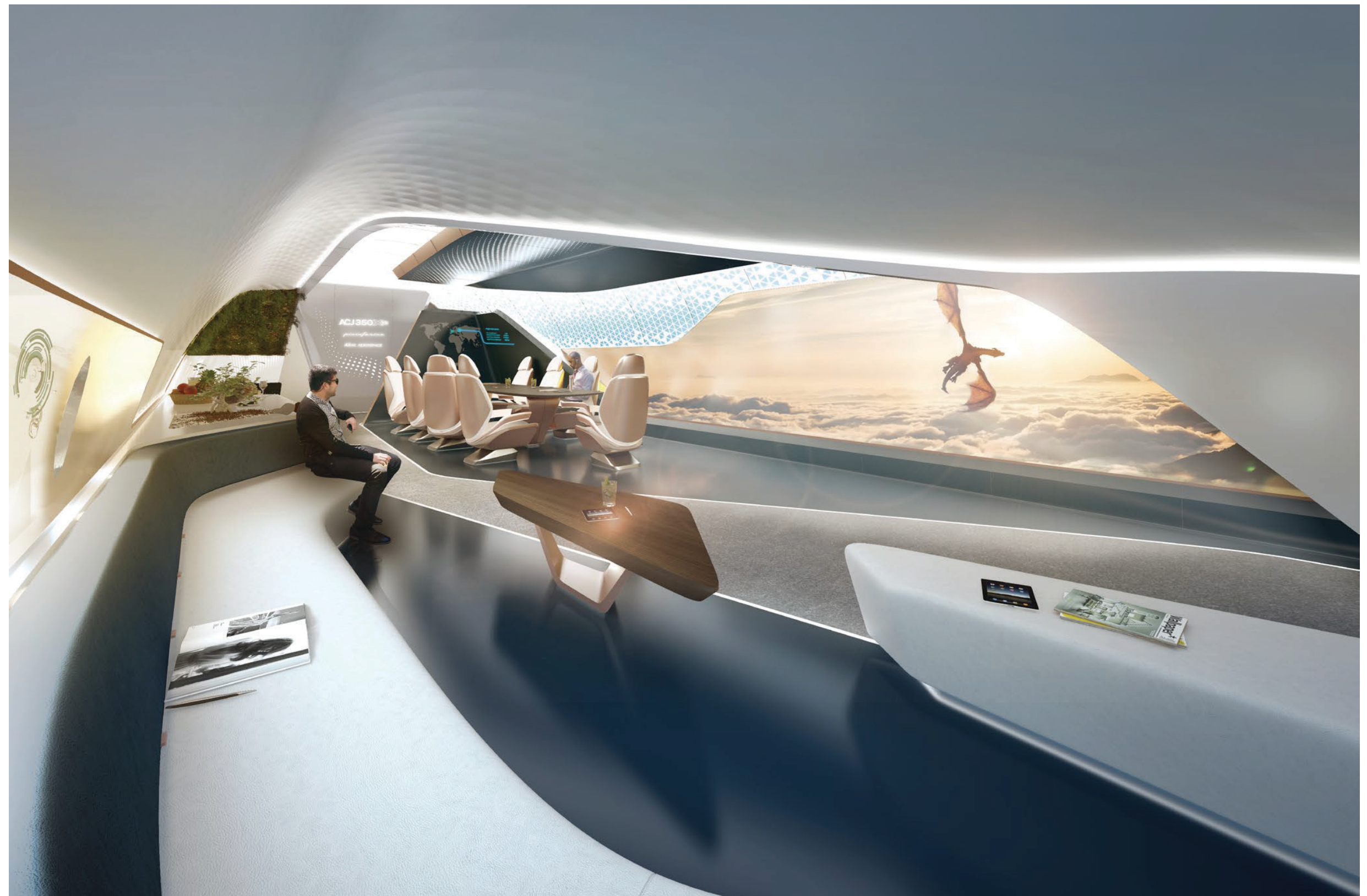
The conference table view of the dragon's world, way above the clouds.

...Now, with great fanfare, "enter the dragon!"... the ultimate concept interior design... a concept destined to radicalize the VIP bizjet interior experience. Pininfarina has recently joined in cooperation with AMAC Aerospace to develop and deliver an inspirational and innovative cabin interior for the recently announced Airbus variant, the A350-900.