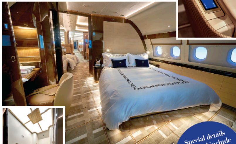
ABOVE: THE MASTER BEDROOM IS A PRIVATE REFUGE FOR THE PRINCIPAL

The cabin features an elegant dining area framed by two spacious lounges. The master bedroom in the aft has a bespoke mattress, and is designed as a space to sleep, or to have a moment for oneself in the study. The luxury en-suite