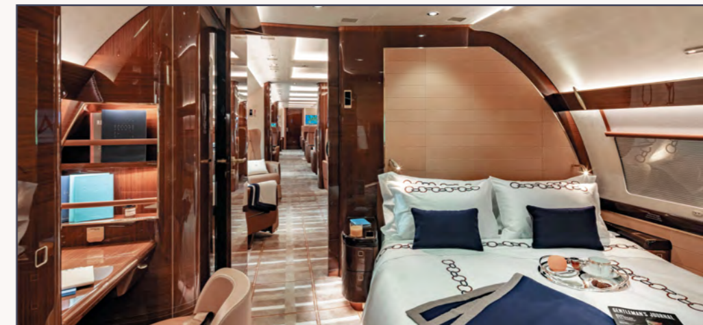
Acropolis Aviation's ACJ320neo has a sumptuously appointed private master bedroom with its own writing desk/dressing table area leading on to a luxury en-suite bathroom with a rectangular shower – the largest ever installed in an Airbus single-aisle aircraft.