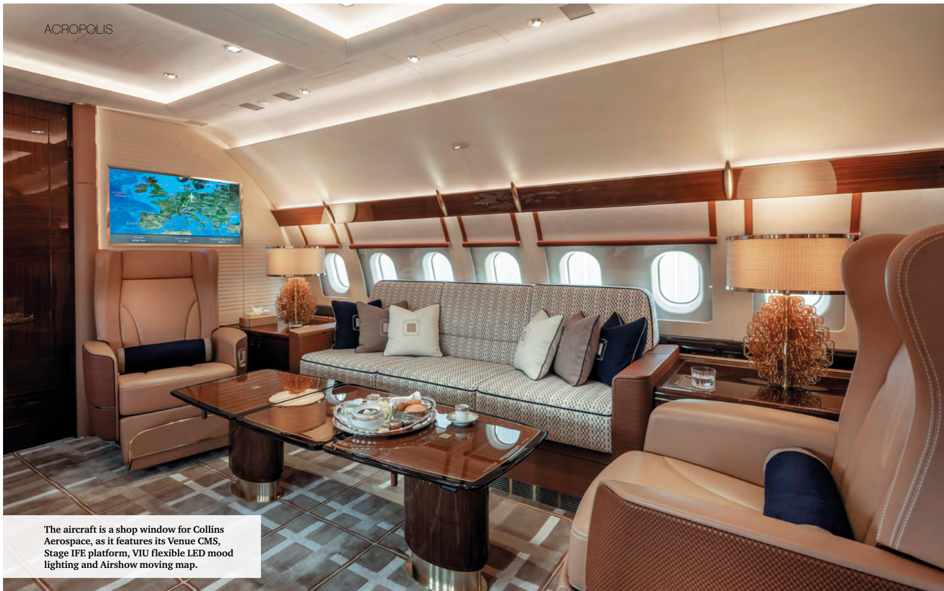
The aircraft is a shop window for Collins Aerospace, as it features its Venue CMS, Stage IFE platform, VIU flexible LED mood lighting and Airshow moving map.