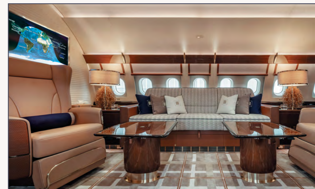
Entertainment can be accessed via 19 individual iPads and four large TV screens throughout the cabin. The aircraft is also fitted with superfast Wi-Fi via Ka-band internet connection.