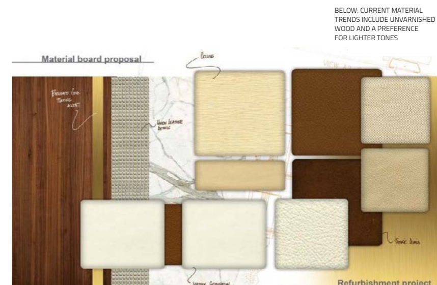
BELOW: CURRENT MATERIAL TRENDS INCLUDE UNVARNISHED WOOD AND A PREFERENCE FOR LIGHTER TONES

He also notes customers want the latest technologies on board, to match what they have at home: "They want to use their personal devices and watch their